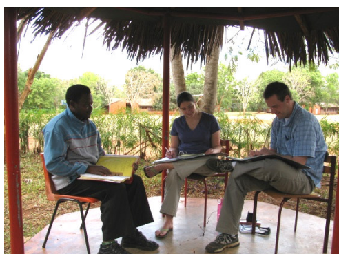
In Class with our Tutor

ney in this new world, up early reviewing the previous day's work as the sun reaches for the top leaves of the baobab trees outside our door.