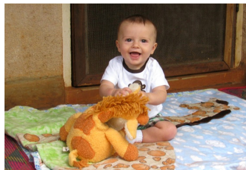
sitting up on his own and playing with Twiga