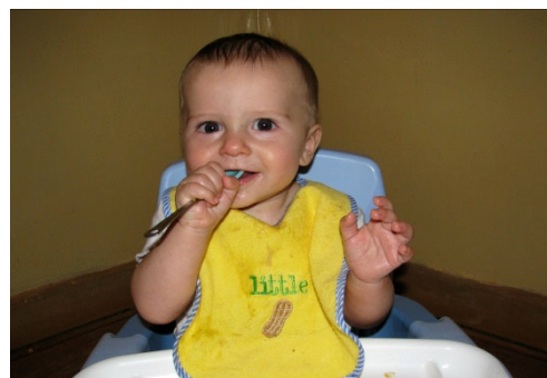
trying to feed himself