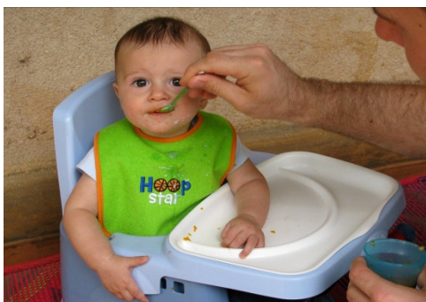
less enthusiasm as his 2nd tooth comes in