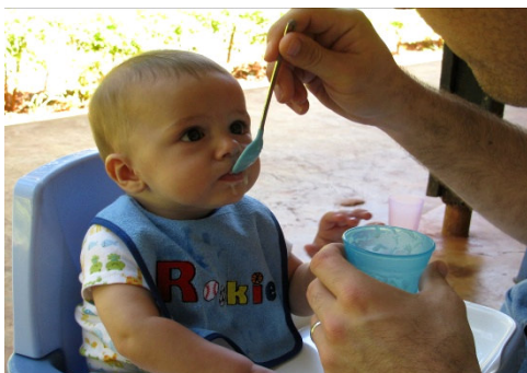
eating "real" food—bananas are popular