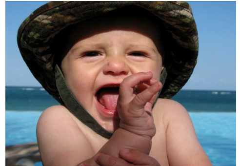
Splashing in the pool in Mombasa