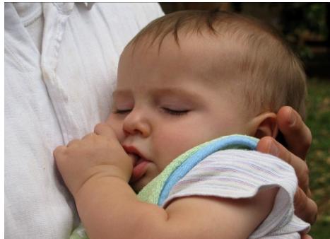
Captured—a rare occasion sucking his thumb