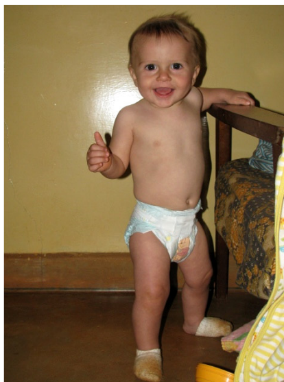
Everything's thumb's up!