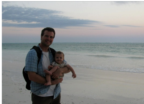
Walking on the beach in Zanzibar