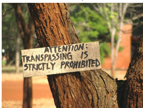
Not a common word, but I guess it's correct.

There is nothing long which does not have an end.