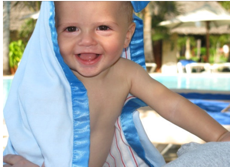
Just waking from a nap poolside in Mombasa