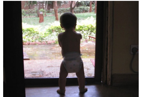
Can I go outside and play?