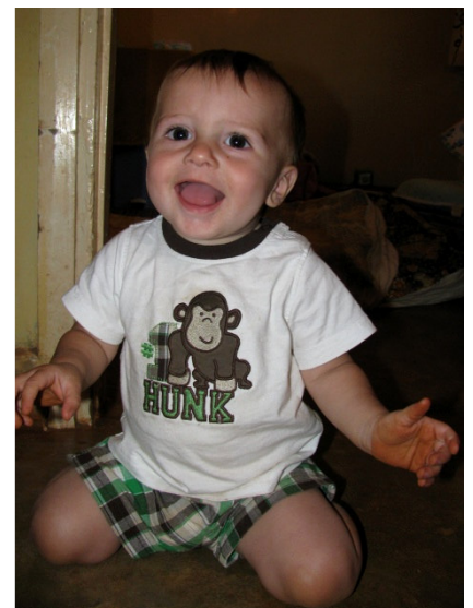
Being cute doesn't come easy.