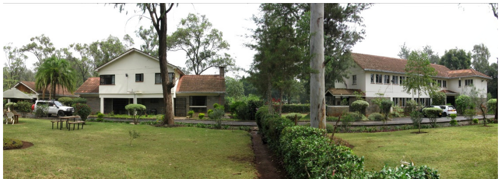
Our new home in Nairobi—residence on the left, and the East Africa Field Office on the right

After 110 days in the United States, 8,748 miles, 38 presentations, 26 sermons, 1 formal Trump Mission Society Gala, 1 newspaper interview, and countless meals with mission boards, hosts, and pastors, we have finally made it back to Africa. It's good to be home.