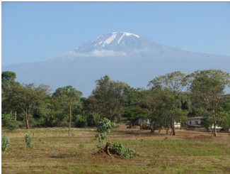
Mt. Kilimanjaro from Tanzania